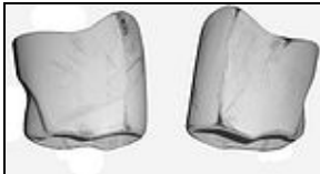
Upper Arm Armor For 501st approval: