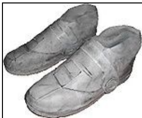
Boots For 501st approval: