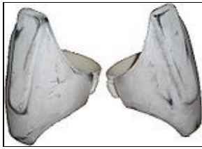
Knee Armor For 501st approval: