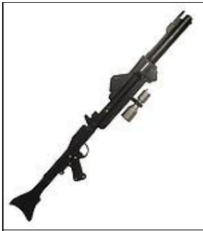
DC-15A Blaster Rifle For 501st approval:

Manufactured by BlasTech Industries, the DC-15A is a tibanna gas, cartridge powered weapon. Hyper-ionized blue plasma bolts are more than capable of penetrating armored units. Exceptionally effective against both droids and contemporary targets.