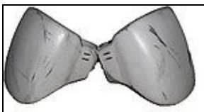
Elbow Armor For 501st approval: