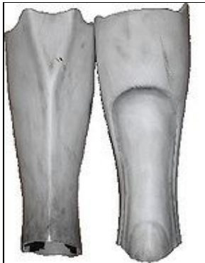
Lower Leg Armor For 501st approval: