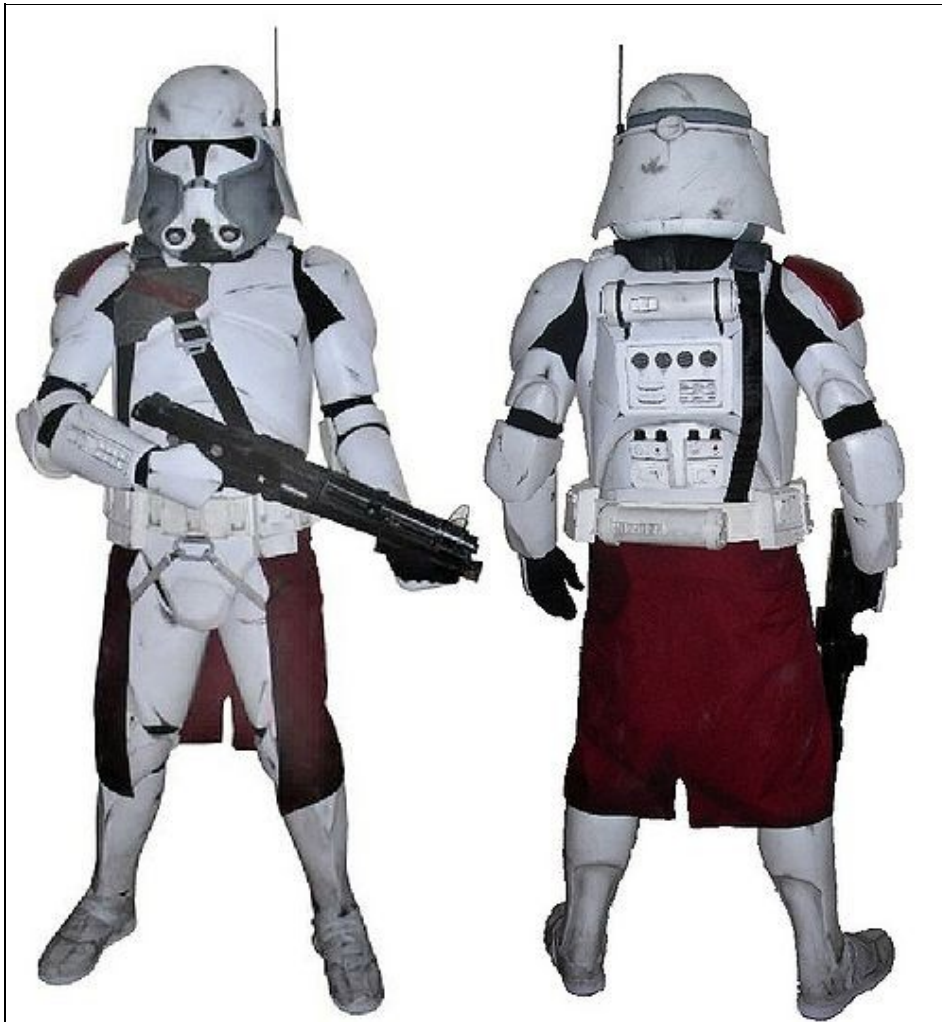
Model CC4841